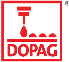
DOPAG Dosiertechnik und Pneumatik AG

The Hilger u. Kern / Dopag group, with more than 300 employees and 7 subsidiaries, is one of the leading manufacturers of machines for metering and mixing systems in the world for plural component polymers and single component media such as greases, oils and pastes.