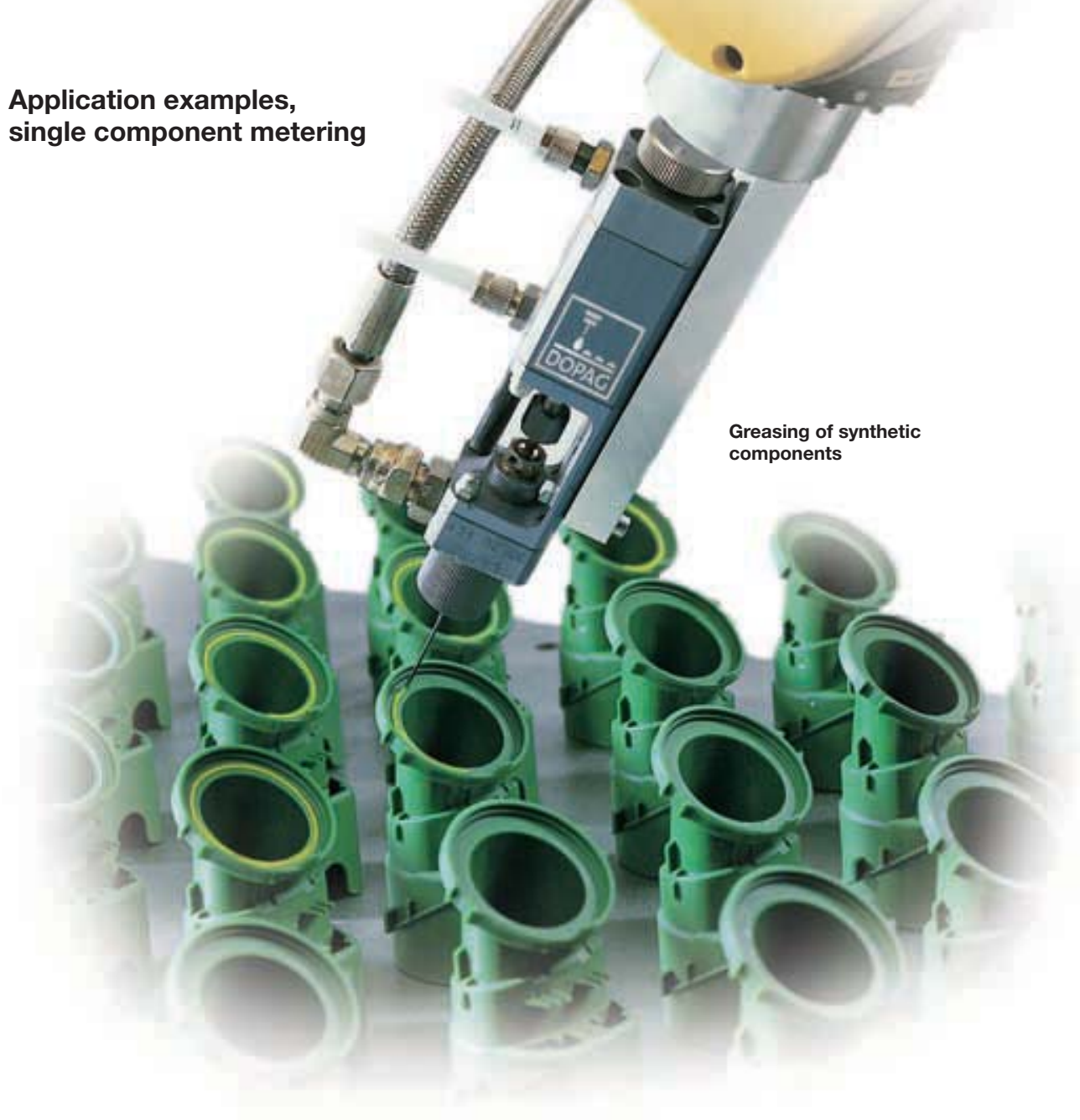
Greasing of synthetic components