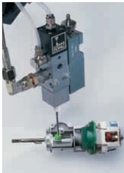
Lifetime lubrication of gears